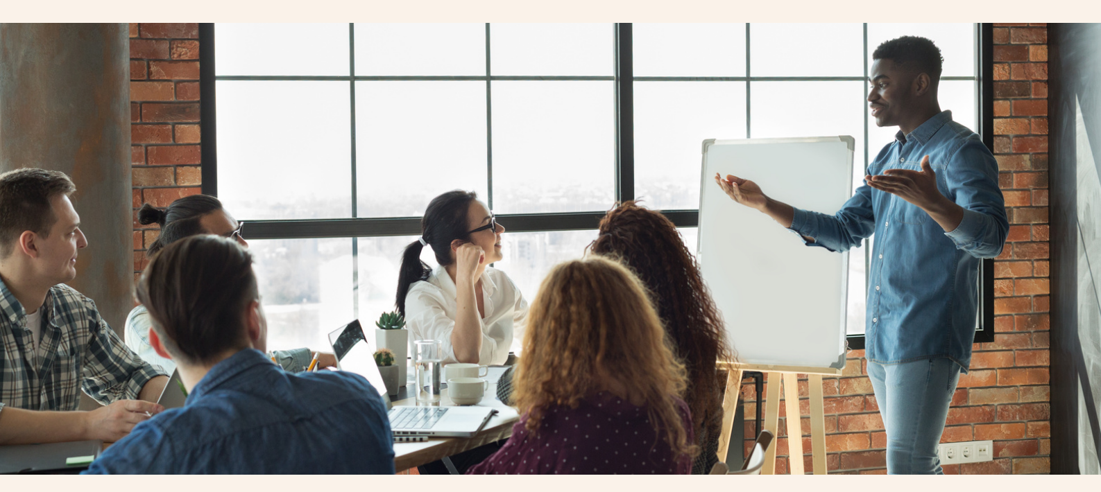
The Ujima Fellowship Program is funded by the Government of Canada.

To learn about Africa Centre and our programs, visit <u>www.africacentre.ca</u>